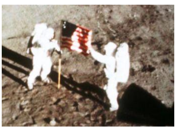
That's one small step for man, one giant leap for mankind

50th Anniversary of the Moon Landing on the 20th