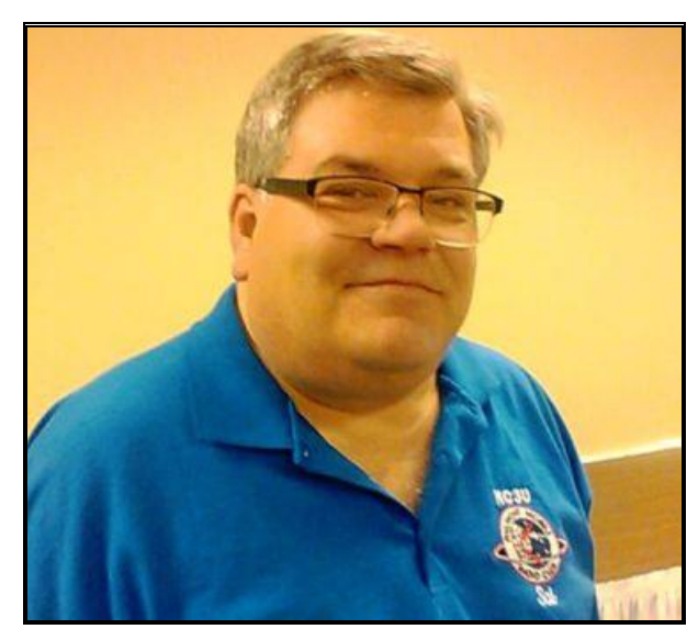
Hello Phil-Mont Members,

Happy Independence Day to all members of Phil-Mont Mobile Radio Club. I'd like to touch on field day for just a second. If anyone has a comment on field day please forward them to me at nc3u@verizon.net.