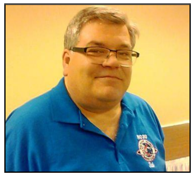
Hello Phil-Mont Members,

CQ FIELD DAY W3EM...was a phrase I heard all day Saturday at Fort Washington State Park. If you missed Field Day this year I'm sorry to say you missed an awesome time. All bands were present and accounted for and working very well. The GOTA stationed was manned and ready for all new comers and quite a few of the older hams. Scouts were having a mini type Jamboree down the road and we had visitors all asking questions.