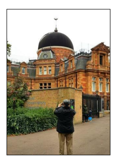
The Royal Observatory at Greenwich. It's on top of a BIIG hill!