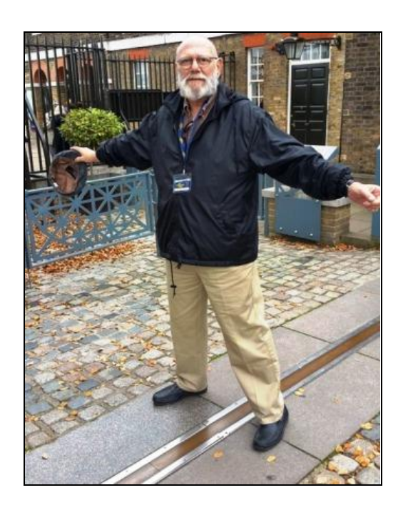
ND3B with a foot in East and West hemispheres