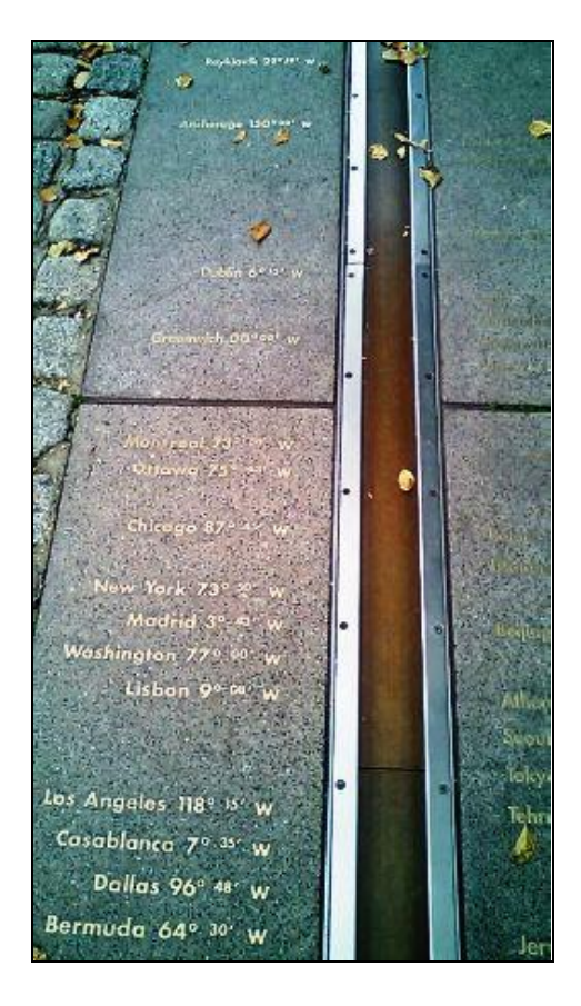
The Prime Meridian with worldwide cities and their latitudes.