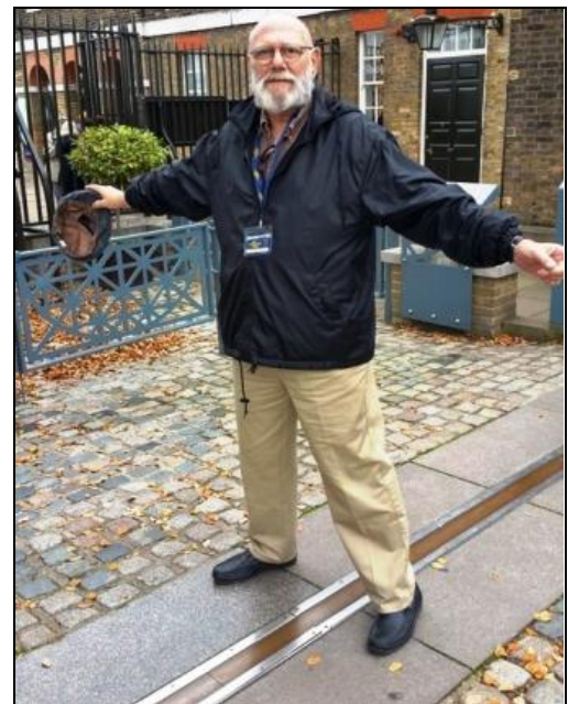
ND3B with a foot in East and West hemispheres