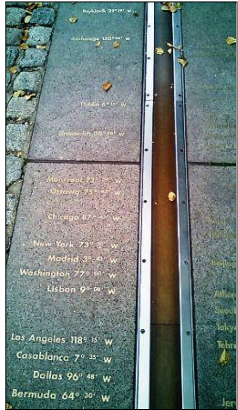
The Prime Meridian with worldwide cities and their latitudes.