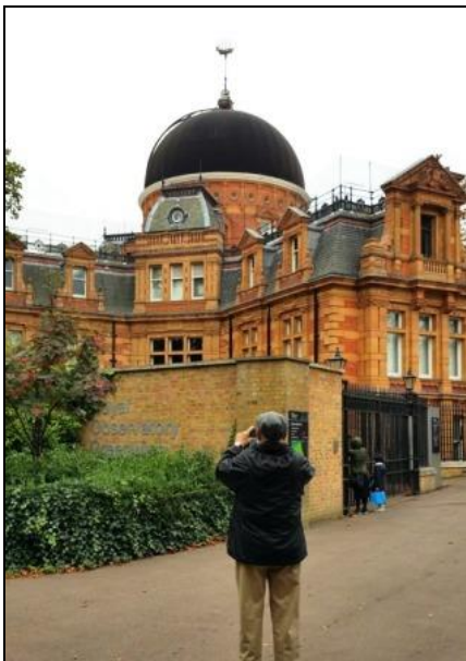
The Royal Observatory at Greenwich. It's on top of a BIIG hill!