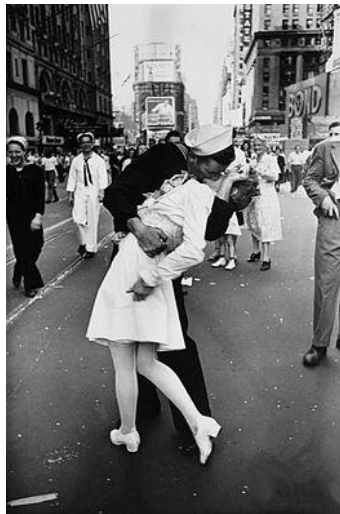
Iconic photo in Times Square- sailor kissing surprised nurse

On August 14 th 1945 Japan surrendered in WWII