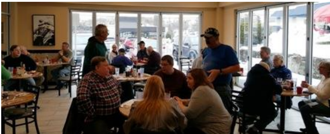
PMRC takes over Andy's

More breaking news and alternative facts on page 7